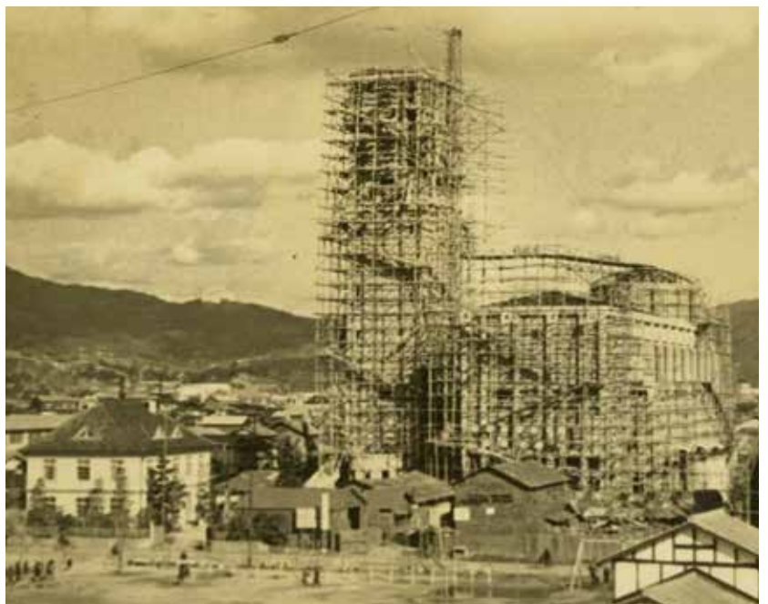
Memorial Cathedral for World Peace, symbol of Hiroshima's reconstruction, being built (circa 1953)