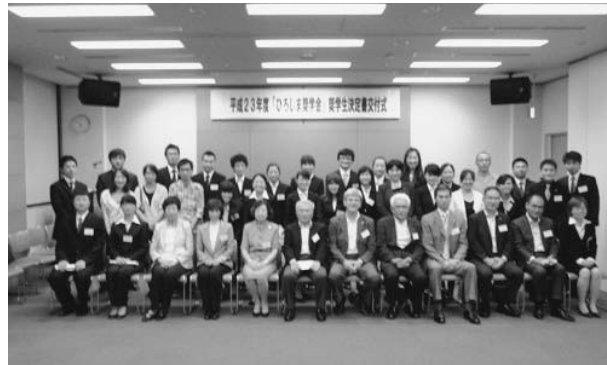
Commemorative photograph at the Scholarship Award Ceremony

As part of the Hiroshima Scholarship Program, this Foundation awards thirty privately-funded international students in the Hiroshima City area with a scholarship of 30,000 yen per month for a one-year period.