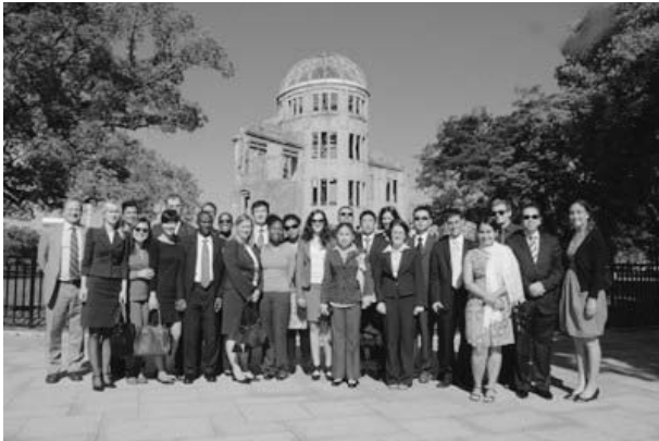
Participants visiting the A-bomb Dome

Participants from the Arms Reduction Fellowship Program, a group of specialists from the governments of twenty-five nations to promote arms reduction, learned about the “The Spirit of Hiroshima” and truth of the effects of atomic weapons through inspections and seminars during their visit from 23 to 25 September.