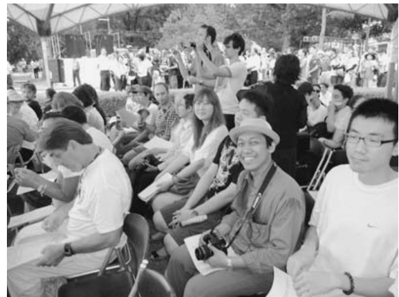
Forum participants attend the Peace Memorial Ceremony