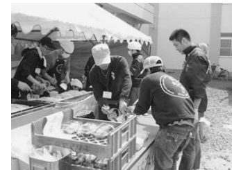
Volunteer activities at Okada Elementary School

Okada Elementary School was just on the edge of the area devastated by the tsunami and looking at the horrible destruction left us speechless. With the large number of evacuees, it wasn't like we could just wish everyone the best of luck, so we put all of our effort into preparing okonomiyaki for them to enjoy.