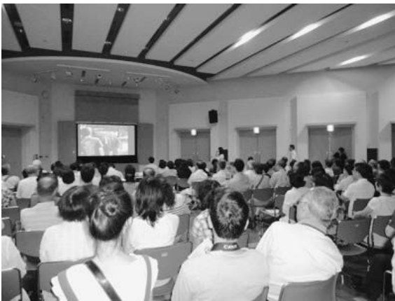
Forum participants listen to a description of the film "The Back of Destiny."