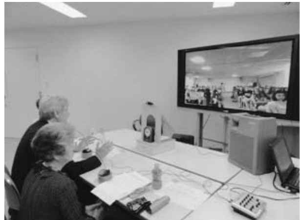
A-bomb Eyewitness testimony via the web conference system

At the Hiroshima Peace Memorial Museum we have presented A-bomb eyewitness testimony via the web conference system to people overseas. These videoconferences convey the facts about nuclear weapons and raise public awareness of the need to eliminate nuclear weapons.