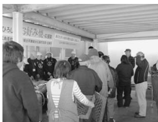
Volunteer activities at Rokugo Junior High School

On the first day, we went to Rokugo Junior High School in Sendai, one of the evacuation centers, and made okonomiyaki. Hiroshima and Sendai cities have a good relationship and thanks to the arrangements made in advance—like where we were going to make the okonomiyaki—things went very smoothly. At this facility, the JSDF, Japan Self-Defense Forces, were preparing and providing meals, so we asked them to take a break (lunch) and allow us to add okonomiyaki to the menu. We had to prepare about 800 meals in 90 minutes, but four employees from the Sendai and Tokyo branches of the Otafuku Sauce Company lent a hand. So, with 15 people working we were able to finish in time.