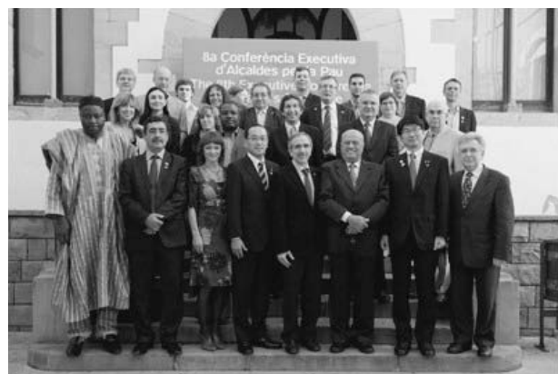
The 8 th Executive Conference of Mayors for Peace held in Granollers, Spain

You have not been hearing much lately because our first steps have necessarily been internal. We are making deep, fundamental changes. Now that we have reached our goal of 5000 cities, we are preparing an important shift—from growing larger to growing stronger. Though we continue our recruitment efforts, we will be putting far more effort into creating and funding a powerful campaign organization capable of