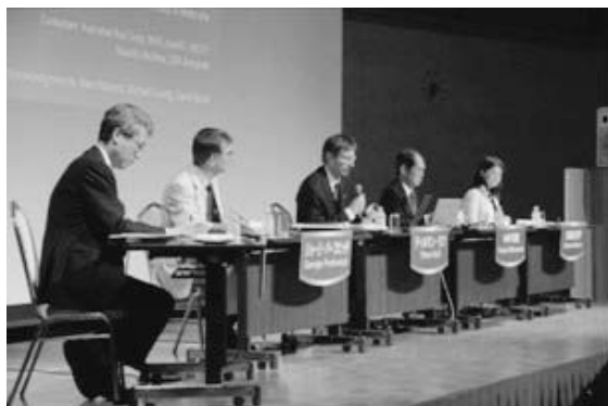
The Panel Discussion