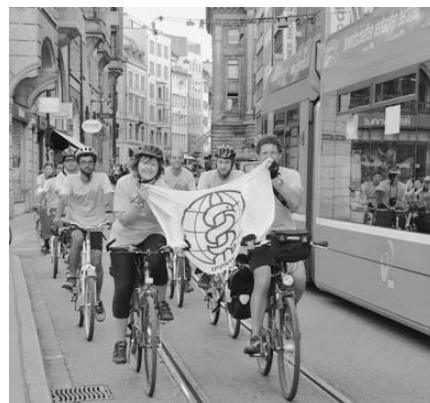
IPPNW medical students on a bicycle tour in support of the abolition of nuclear weapons in Basel, Switzerland in 2010. A tour from Nagasaki to Hiroshima is planned for the run-up to the 20 th IPPNW World Congress to be held in Hiroshima on August 24-26, 2012.

There are believed to be two basic ways in which people's minds work: systemizing (S) and empathizing (E). S types are logical and attach importance to the intellect. They systematize, order things and emphasize hierarchy. E types balance intellect and sensitivity. They are tolerant, good at collaborating with others, and showing consideration for the weak. They also have good communication skills. S types forge straight ahead toward their goals whereas E types don't mind taking a roundabout way in order to move one step forward. S types try to subjugate nature while E types try to coexist with it. It is generally said that men tend to be S types whereas women tend to be E types, but men and women have elements of both types, and people who are extremely one way or the other may face difficulties socially. Modern society was developed by mainly S-type thinking. Now is the time for E-type thinking to be used to overcome the environmental and human survival issues that have arisen as a result of the development of modern society. This also means a gender-equal society being inevitable.