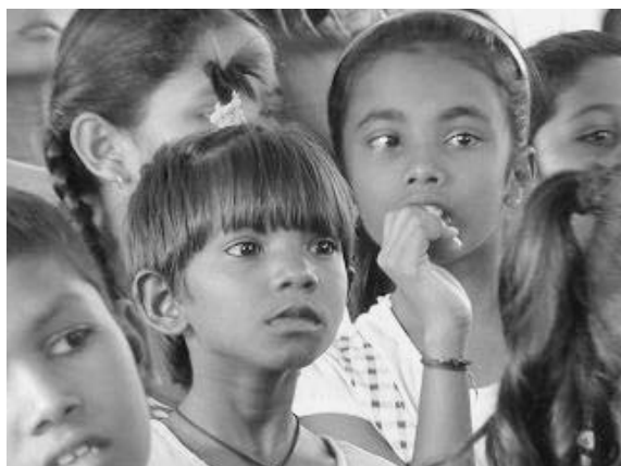
Children staring at the puppet show

ing, and everything needed for the puppet show. They even performed the show themselves in the local language. They prepared for the day of the show with many rehearsals.