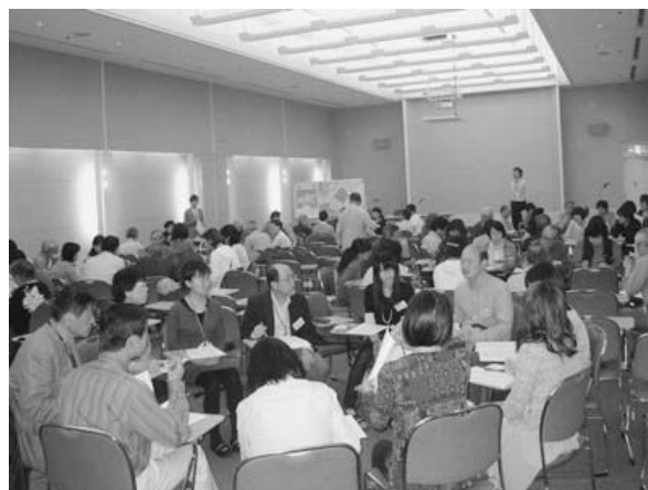
Group Discussion at the first meeting of the Peace Forum