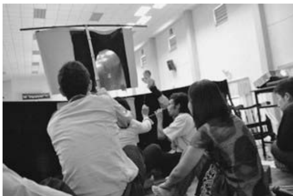
The volunteers performing the puppet show

The solution they came up with was a puppet show on the theme of Hiroshima, sure to be popular with the Sri Lankan children who love films and cartoons. The volunteers developed not only the scenario but also the puppets, the set, light-