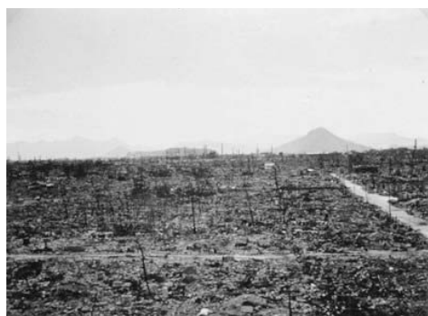
Looking south from a building roof near Yamaguchi Town (currently the area of Kanayama Town, Ebisu Town and Nobori Town). With nothing blocking the view, it was possible to see as far as Ninoshima Island (4,000m out to sea from Hiroshima City) floating on Hiroshima Bay.

On August 7, I looked down over the city of Hiroshima from the hill in front of the shrine. Burnt ruins spread as far as the eye could see, and I could pick out the remains of a number of buildings including the department store Fukuya and the former Chugoku Shimbun building. The sea that I could see beyond that felt so close that I could touch it. Smoke from cremations rose up from the park just nearby and every now and then the stench of burning corpses wafted over. From that day, I climbed those stone steps every day and continued to gaze over the city of Hiroshima.