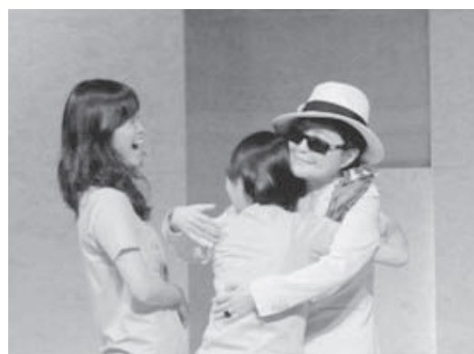
Yoko Ono (far right) happily receiving a paper crane lei from junior and senior high school peace club

Yoko Ono, the recipient of the 8th Hiroshima Art Prize which is given to contemporary artists that have contributed to peace, offered a keynote message saying “No more Hiroshima” is not to remind us of the victims, but is something we want to do for them, give them a world with no more Hiroshimas. She strongly declared that if all the people who are pushing for a world without nuclear weapons do whatever small good deeds they can, they will lead us to world peace.