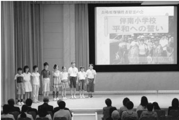
A presentation by Tomo-minami Elementary School Student Council

Renewing our commitment to future generations and the abolition of nuclear weapons