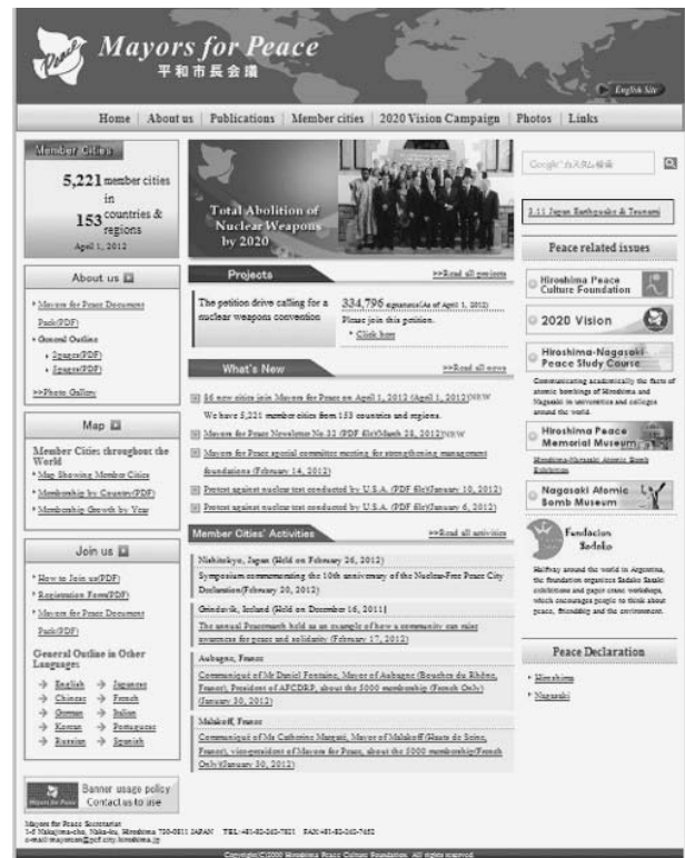
Mayors for Peace Web Site

The “adults” (governments and corporations) don’t really want to kill us, but they are dominance-seeking war-culture dinosaurs desperately in need of enlightened, peace-culture guidance. They need to know another world is possible, that you are willing to sacrifice to move into that other world, and that you will resist wholeheartedly the destruction of this planet or any group of people on it. Please find any way you can to send them this message before their old war-culture habits carry us all right over the cliff. Thank you.