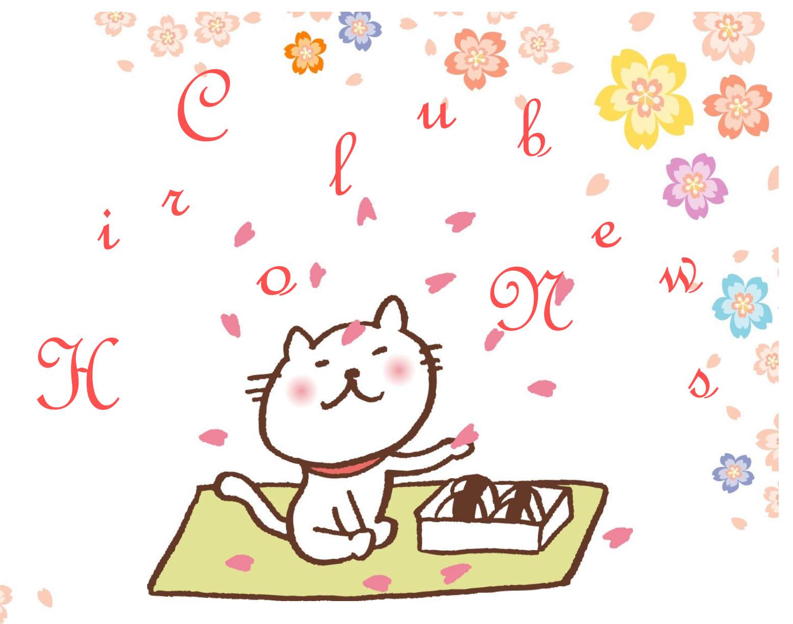
For your cultural life in Kiroshima