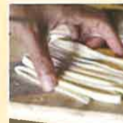
Hands-on Udon noodle making experience