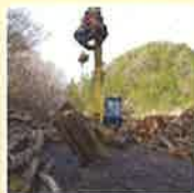
Learn the local energy facilities