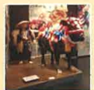
Enjoy Japanese traditions