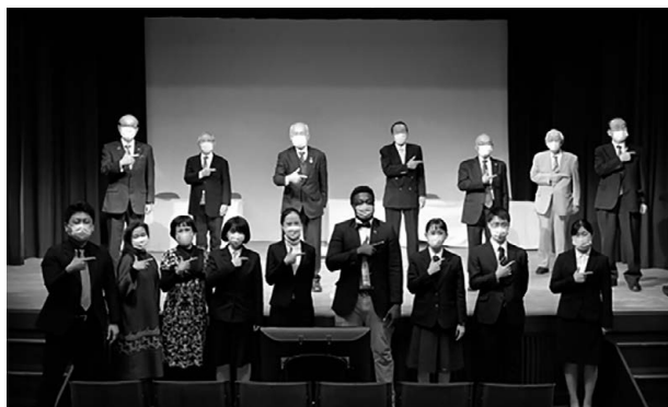
Participants at the Hiroshima venue