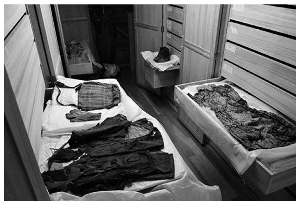
Artifacts stored in the storage