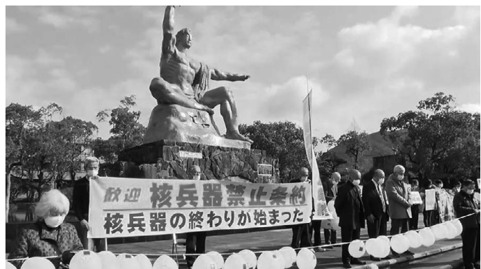
Civic actions to commemorate the TPNW coming into effect (January 22, 2021, Hiroshima and Nagasaki).