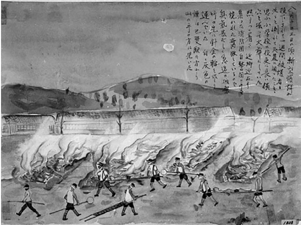
“A-bomb Drawings by Survivors” by Yokichi Tszuawa (Firefighters and vigilantes cremating in the national school playground.)

On a table placed near the school gate were white paper bags around the size of postcards, lined up on the table. “They’re handing out snacks!”, I thought. I was starving and I lined up, but when I got a closer look I was disappointed. The bags contained bones. Relatives who had come to look for their loved ones who had died were taking home their bones, so that at least they could commemorate them in death. Records show that around two thousand people were cremated at this school, and it seems that many of them were junior high school students who were involved in building demolition work when the bomb was dropped, as well as 1 st and 2 nd year female student. I cannot imagine how painful it was for them. How much they wanted to survive. They lost everything in an instant.