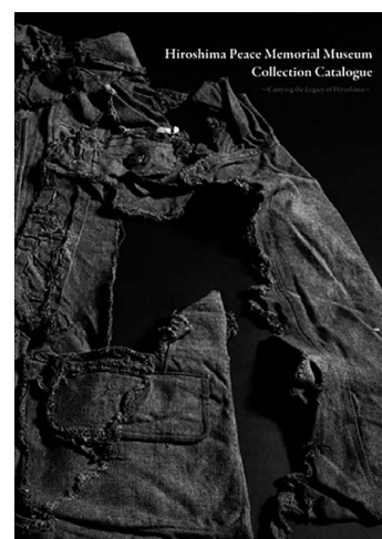
[Cover] Student uniform removed with scissors (Donated by: Yuko Horio)

Japanese and English are provided in separate versions of the catalogue, which means that there is more space in the layout and the catalogue is easier to read than the previous version.