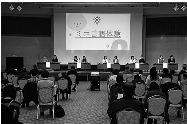
Presentations on Hiroshima Sister and Friendship Cities by Hiroshima Messengers

Hiroshima 2020 Messengers, two from each of the six cities, gave presentations on their sister and friendship cities. There were also quizzes on the theme of each city and mini language experiences. Not only the participants but also the Hiroshima messengers themselves enjoyed the event.