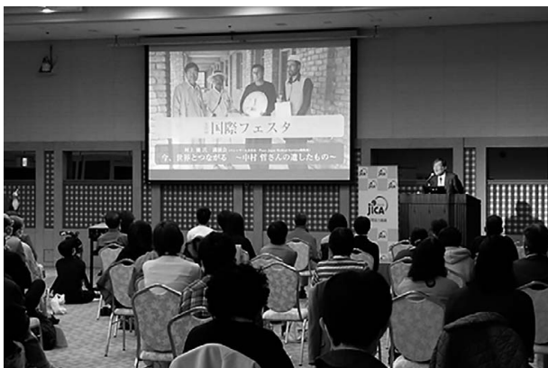
Lecture "Connecting with the World Now: What Dr. Tetsu Nakamura Left Behind"